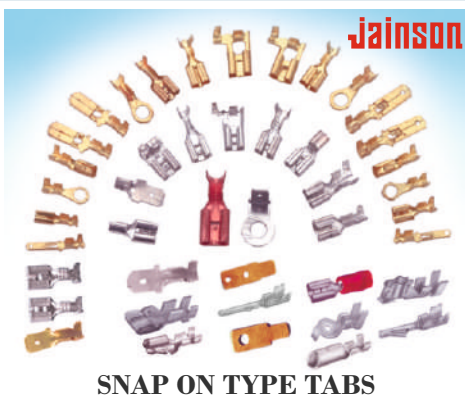
SNAP ON TYPE TABS